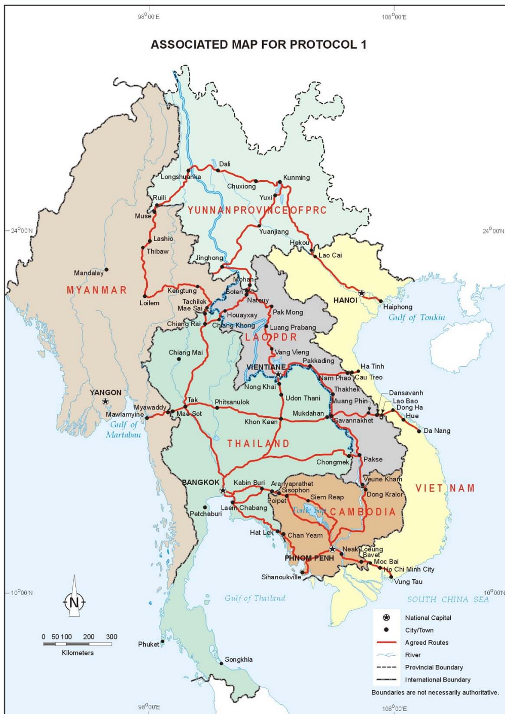
ASSOCIATED MAP FOR PROTOCOL 1